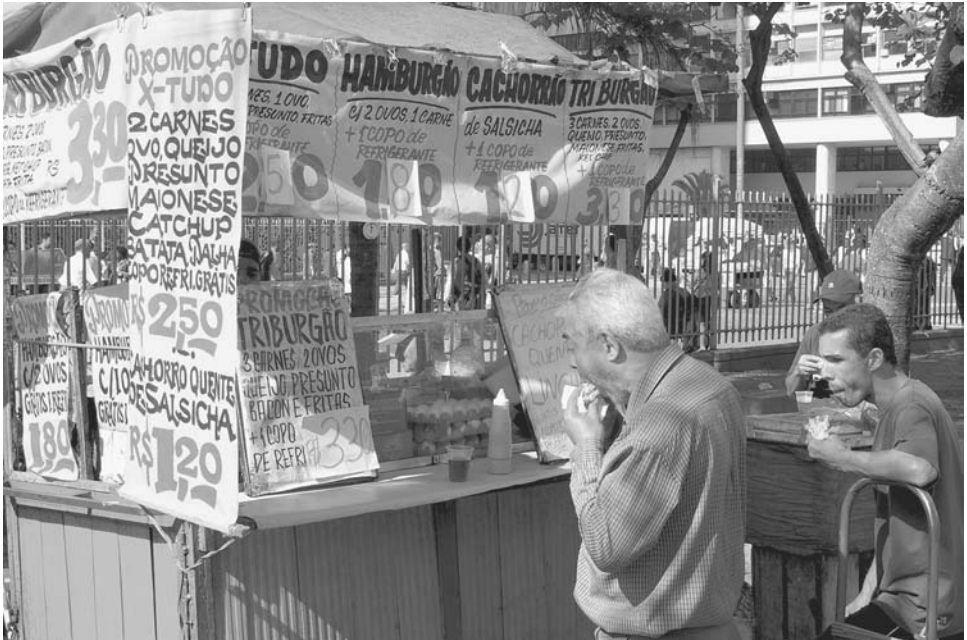
Fast food stand in Rio de Janeiro, Brazil.

This thick rich soup is popular in northern Brazil, especially cities in the states of Acre, Amazonas, and Para. It is one of the last indigenous foods available in urban surroundings and is sold mainly by women. The broth, called tucupi , is made from fermented cassava juice, gum starch (also from cassava), and dried shrimp stock mixed with jambu (paracress), a green vegetable that makes lips and tongue tingle.